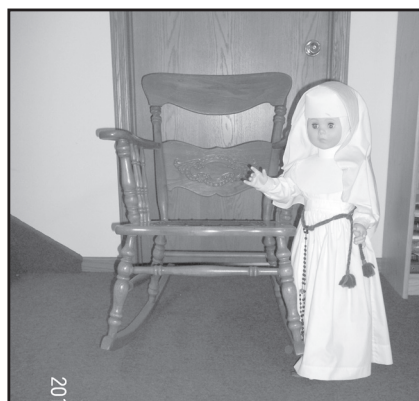
PRESS BACK ROCKER