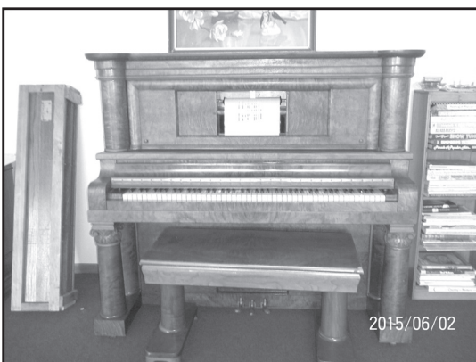
WINDSOR PLAYER PIANO

FURNITURE... 2 king size bed/Hollywood frames • Matching wood dresser/Mirror • Desk • Walnut dresser/Hankie drawers • Computer desk • Oak chest of drawers • Maple chifferobe • 2 twin beds/Hollywood frame/Headboard • Red oak tables/2 leaves • 48" red oak table/5 leaves • Cedar chest • 8' couch • Press Back Rocker • Record cabinet • 2 press back chairs • Outdoor furniture • Assorted oak rockers • Red oak table • Desk-organ base • Walnut dresser/Mirror and hankie boxes • Walnut buffet • Pine belly cabinets - 1 with tin drawers • Bookcases • 2 benches • 6 folding wood chairs • Oak odd fellows captains chair • 2 bar stools • Oak flower stand • Iron oval coffee table/glass top • Corner shelf • Free standing mirror • Wood Rocking Horse